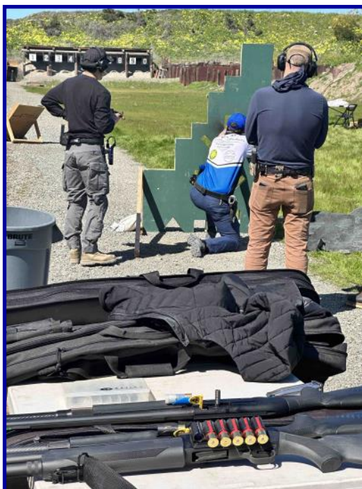
MARCH UML MATCH

https://www.richmondhotshots.com/intro-to-comp-class