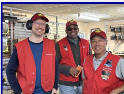
A few of RRCG's Pistol & Rifle Range Volunteer CRSO's!